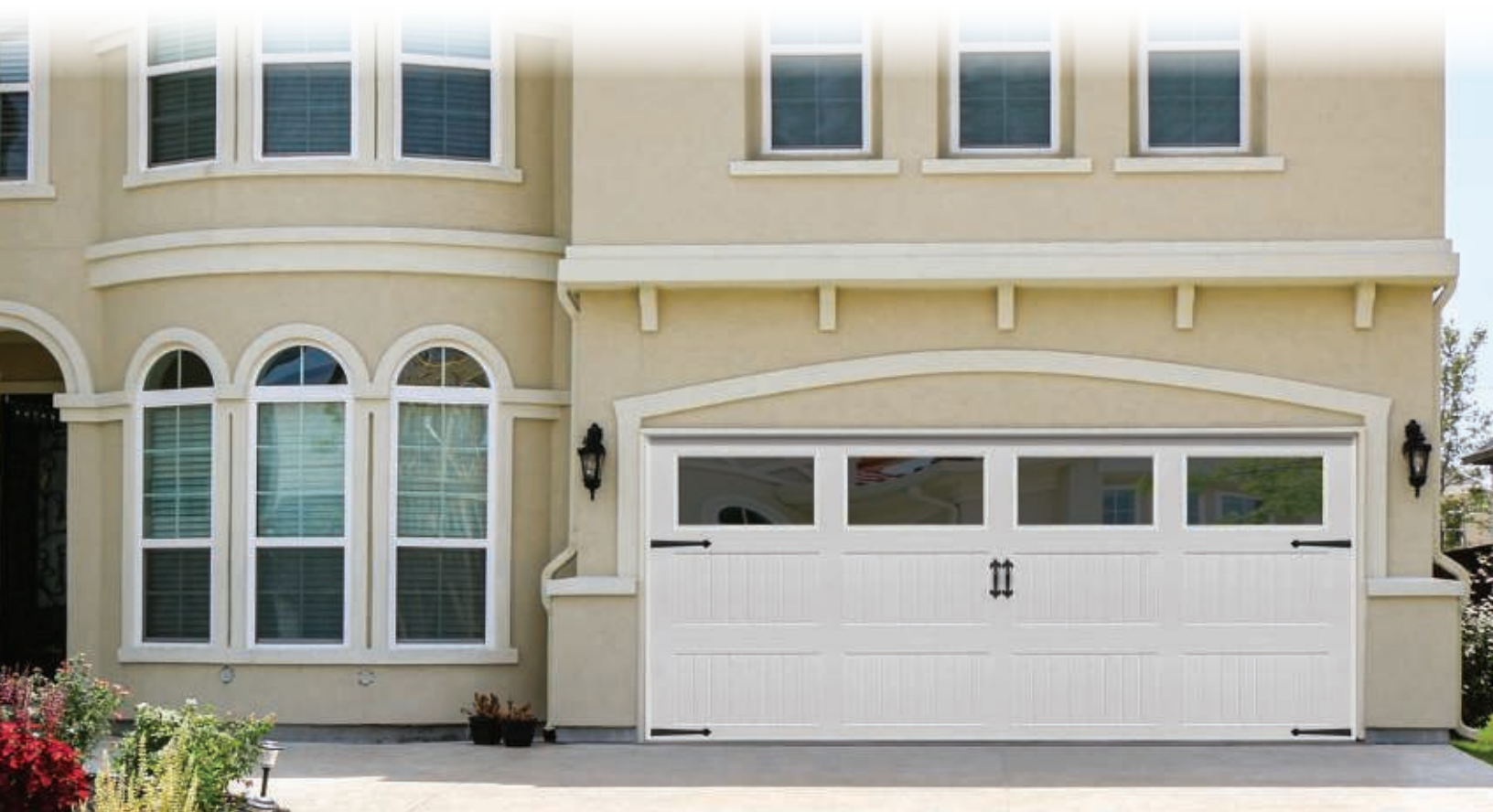
Model 5800, Recessed panel (502), White finish, Plain Window Long, decorative hardware