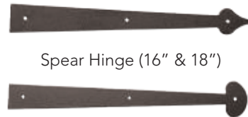
Spear Hinge (16" & 18")