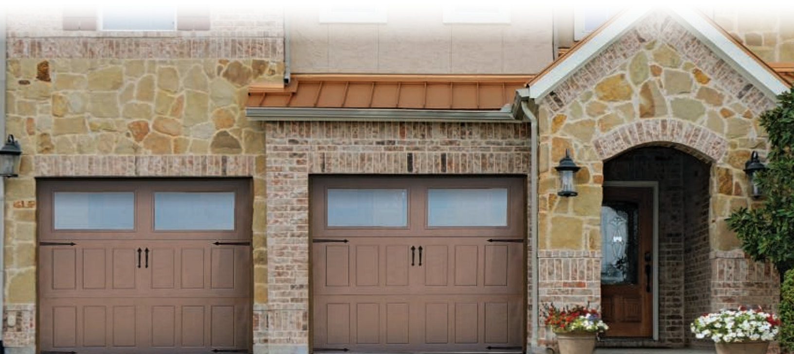
Model 5800, Vertical Raised panel (501), Brown finish, Plain Long windows, decorative hardware